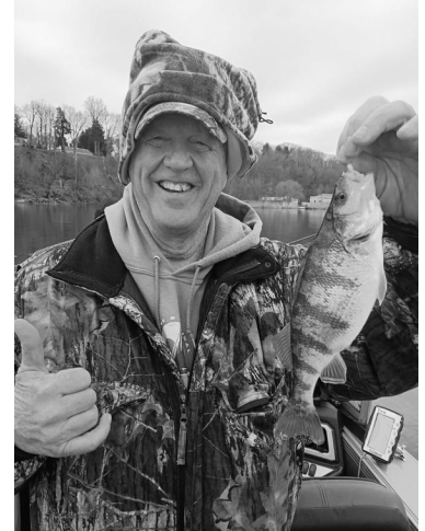
◀ Scene at Holland Street on March 25th

Anglers have realized good success harvesting perch and crappies from Presque Isle Bay. Holland St Dock a location of choice for many. There also were numerous boats working the head of the Bay, areas just inside the channel as well as Misery Bay.