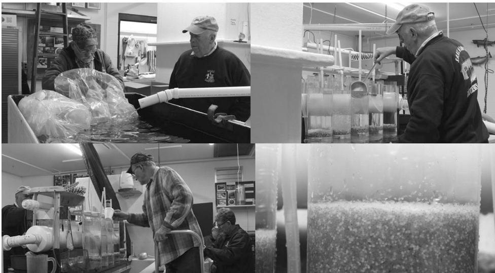
Walleye eggs arrive 2024

Our Hatchery's Allotment of Walleye Eggs was picked up at PFBC's Linesville hatchery by members of our hatchery team on Wednesday April 3. The walleye began spawning earlier than usual due to the mild winter. Our allotment this year was 1,600,000 eggs, they were packed into large plastic bags of water which are given a shot of oxygen and sealed. When they arrived at our hatchery the bags were kept closed and floated in one of our holding tanks until the temperatures match the water flowing into our tanks. The eggs were then gently transferred from the bags into our hatching jars using a ladle. They eggs were already eyed up and even some were already hatching.