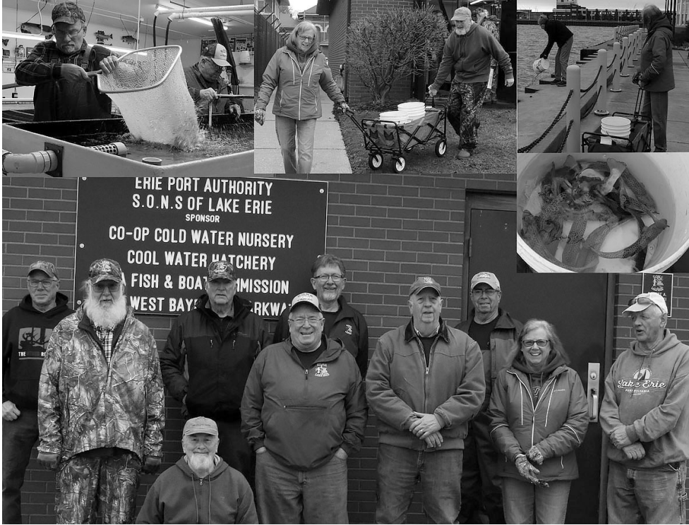
Brown trout Stocking 2024

Brown Trout Stocking On Wednesday March 27, 2024 the SONS of Lake Erie Hatchery Crew and seven volunteers stocked approx. 800 legal size brown trout in to the waters of Presque Isle Bay which are adjacent to the SONS hatchery. The trout were carried by volunteers by the bucketful out of the hatchery. The browns were brought to the facility on Nov. 17, 2023 where they were fed and cared for by the volunteer crew. Approx. 100 fish were held behind so that they could be held for display for visitors to our upcoming open house.