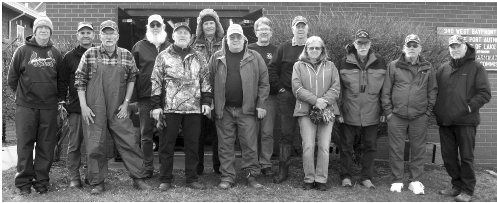
Above are a few photos showing the crew of SONS Volunteers who worked stocking this year's batch of brown trout.

Phase II of the 2022-23 hatchery season began on Wednesday April 5th when our allotment of 1 million 700 thousand walleye eggs were brought from PFBC's Linesville hatchery by our members of our hatchery crew and placed into our hatching jars for incubation. This operation has been in operation since 1985 during which millions of walleye perch and thousands of trout and steelhead have been produced and stocked into Presque Isle Bay.