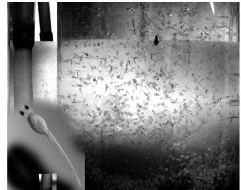
Above is a photo of the walleye fry hatching with a close up picture of a newly hatched walleye called an "eyed wiggler" in the lower left corner.

Phase II of the 2022-23 hatchery season began on Wednesday April 5th when our allotment of 1 million 700 thousand walleye eggs were brought from PFBC's Linesville hatchery by our members of our hatchery crew and placed into our hatching jars for incubation. This operation has been in operation since 1985 during which millions of walleye perch and thousands of trout and steelhead have been produced and stocked into Presque Isle Bay.