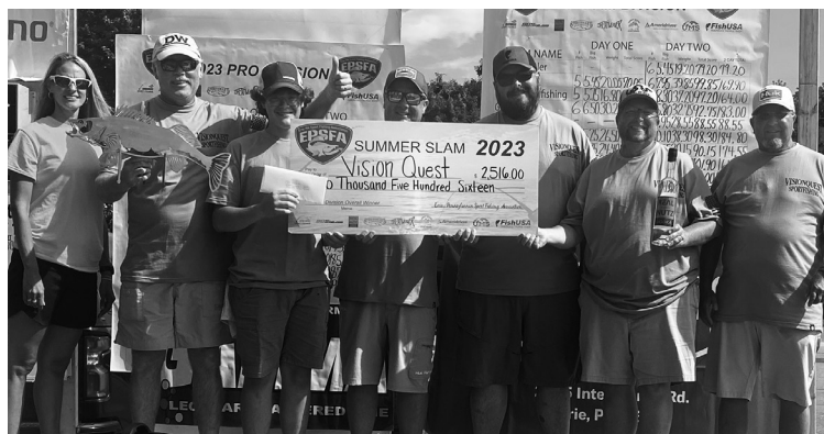
Team Vision Quest won 1st place pro division