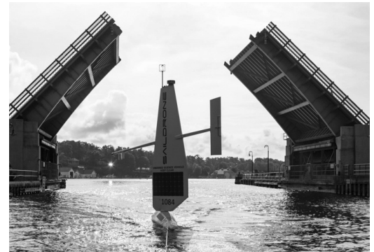
A saildrone in Charlevoix headed out to northern Lake Michigan.

The operators say notices about the autonomous vessels have been sent to the U.S. Coast Guard to provide to mariners.