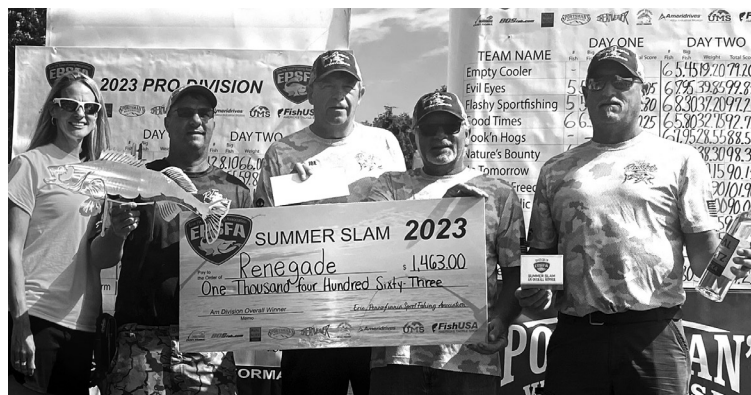
Team Renegade took over 1st place in the amateur division