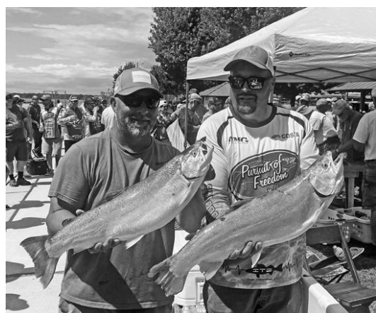
The biggest fish for both days of the EPSFA tournament was a 11.5 pound steelhead caught by team Pursuit of Freedom who also won the 1st day Amateur Division