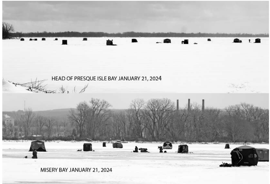
HEAD OF PRESQUE ISLE BAY JANUARY 21, 2024

A strong arctic blast of nearly zero weather caused enough ice to form across Presque Isle Bay during the last weeks of January. The ice grew to a thickness between 4-6 inches in Misery Bay and the head of the Bay drawing out hundreds of fishermen. On Sunday, January 21st I counted about 40 tents at the head and another 60-70 in Misery Bay. A warming trend and high winds quickly eroded the ice making it unsafe by the first week of February. Soon after the ice vanished, anglers were out on the piers and even in an occasional boat with many of them realizing some nice catches of perch. At the time of this writing the water temperature in the bay is hovering close to 32 degrees making it possible for it to freeze again with another cold spell.