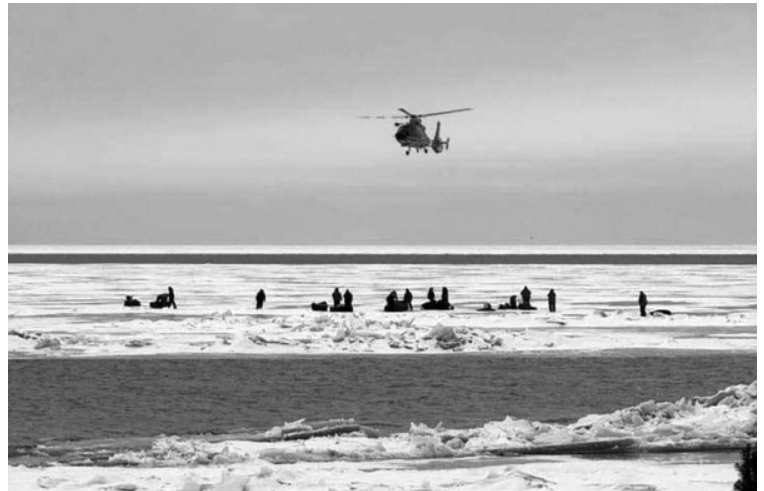
USCG Helicopter hovering over stranded ice fishermen on Lake Erie