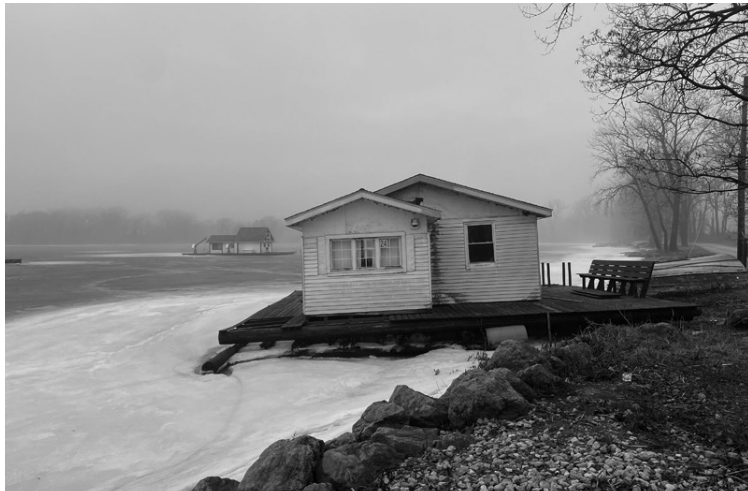
Houseboat #24 was pushed ashore on Horseshoe Pond

helicopter as well as airboats. Local fire dept. rescue teams also joined in. Seven fishermen were rescued by helicopter, 9 by boat, and 4 made it off by themselves. Thankfully there was no loss of life. Locally, high winds caused flooding and downed trees causing the closing of Presque Isle. Houseboat #24 broke anchor grounding it on the shore in Horseshoe Pond.