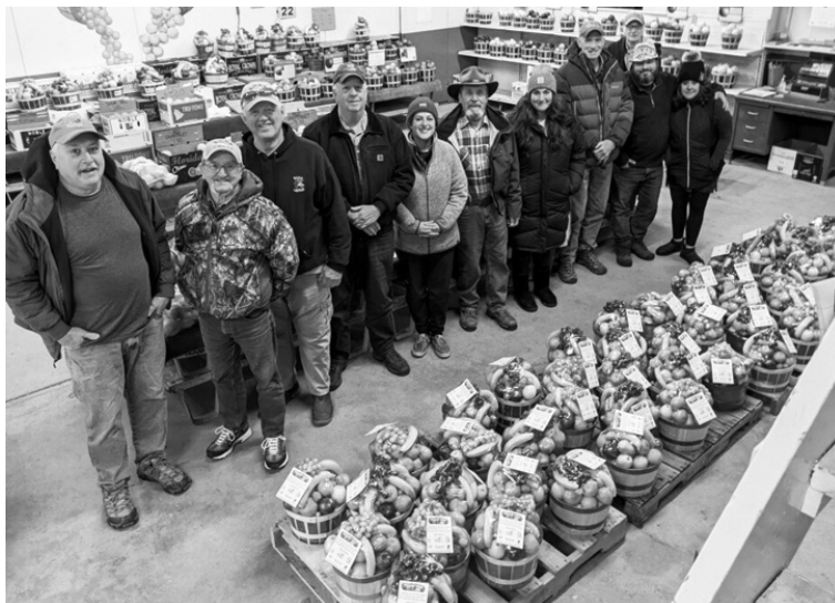
was taken on December 17, the second day of the distribution, as the volunteers get ready to go out and deliver the baskets.

was completed on Saturdays December 10 & 17, 2022 by members of the PA Steelhead Association, S.O.N.S. of Lake Erie, 3.C.U. Trout Association, TU, and Gem City Outdoorsman's club and many others who volunteered their time delivering fruit baskets to landowners that allow public fishing access along their stretches of Steel-head streams. 91 baskets were provided by Sabol's Fruit Farm. The fruit basket program has been in place since the 1990s. Landowner relations are essential to maintain fishing access along the Erie Steelhead streams—there are miles of property that are available for fishing thanks to land-owner permission. Please treat all property with respect but be especially gracious when fishing private property open to the public; stick to clear paths, read and follow all signage.