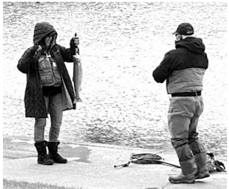
Above is a proud lady showing off a nice steelhead that she caught in the boat basin at Walnut Creek.

The ice came and went during the last days of December. There were a few brave souls that ventured out on to it mostly in Horseshoe Pond and Misery Bay. There were others who fished through the ice while sitting safely on the piers at the PI Marina and a few near the head of the Bay. Some reports indicate that there was some success even one angler reported catching a steelhead, Steelhead anglers are still at it. I counted 19 people fishing on the beach at Trout Run the other day. The long term forecast calls for mostly above average temperatures until around the 17th of January. Maybe we'll get ice after that.