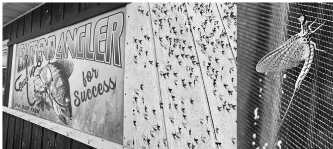
Kirk Rudzinski proprietor of East End Angler bait shop sent us pictures of the outside of his store taken the first week of July showing the mayfly hatch. The photo on the right of a mayfly was taken by SONS director Jack Bock at the same time.

Mayflies spend most of their life as nymphs underwater - except for a short period in the summer when they breach the surface and sprout their adult wings and take to the skies with one mission to find a mate and then make it back to a watery habitat to lay eggs and die. The eggs then sink to the bottom where the nymphs burrow in and repeat the cycle.