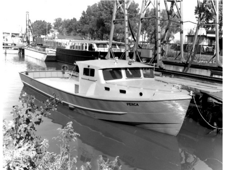
The Perca configured as a patrol boat.

Lake Erie supports over 107 fish species, including walleye, yellow perch, trout, bass, and salmon.