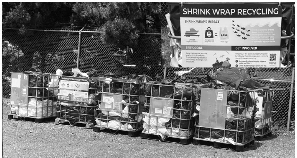
Some of the many shrink wrap recycling bins located at EWPPA marinas. Over 2500 pounds of shrink wrap material was collected.

Dr. Jeanette Schnarrs from the Regional Science Consortium spoke at our May general meeting about the Clean Marinas Program. The recycling of plastic boat shrink wrap material is one part of the program The Erie Western PA Port Authority joined into the program offering collection bins for collecting. The RSC Team processed 100 plastic boat shrink wraps this season to divert over 2,500 pounds of plastic from the landfill. This is equivalent to 206,200 plastic bags! This plastic will be recycled into guardrail offset blocks, protecting