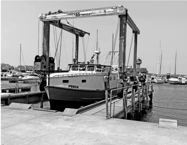
The Perca in the slings of the travel lift ready for launching

50 x 12 x 4 ft. and it displaces 20 tons. The hull is constructed of steel with aluminum topsides. It has served well and needs to be upgraded. The replacement vessel should be ready next year.