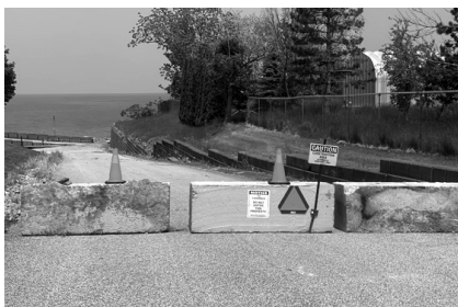
Sad times at the barricaded NE Marina and boat launch.

North East Marina Update – The wall that collapsed at the NE Marina is still not repaired and the facility is shut down for launching and mooring boats. The bait shop and restaurant that are located there, however are open. Give them your support go in and have a meal or buy something.