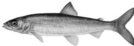
The Cisco ( Lake Herring) is a sub species of the Trout and Salmon family

According to PFBC's Lake Erie Unit Manager there is a remnant of Lake Erie Cisco living in Crystal Lake in Susquehenna County. In 2021 PFBC biologists harvested cisco from Crystal Lake and compared their DNA with known Lake Erie cisco samples and found a match. There is a program in place that the US Fish and Wildlife Services has in place to restore native fish populations into the waters of Lake Erie like their work with lake trout which has been ongoing. There is a positive match and the USFWS is planning to attempt to restore cisco populations.