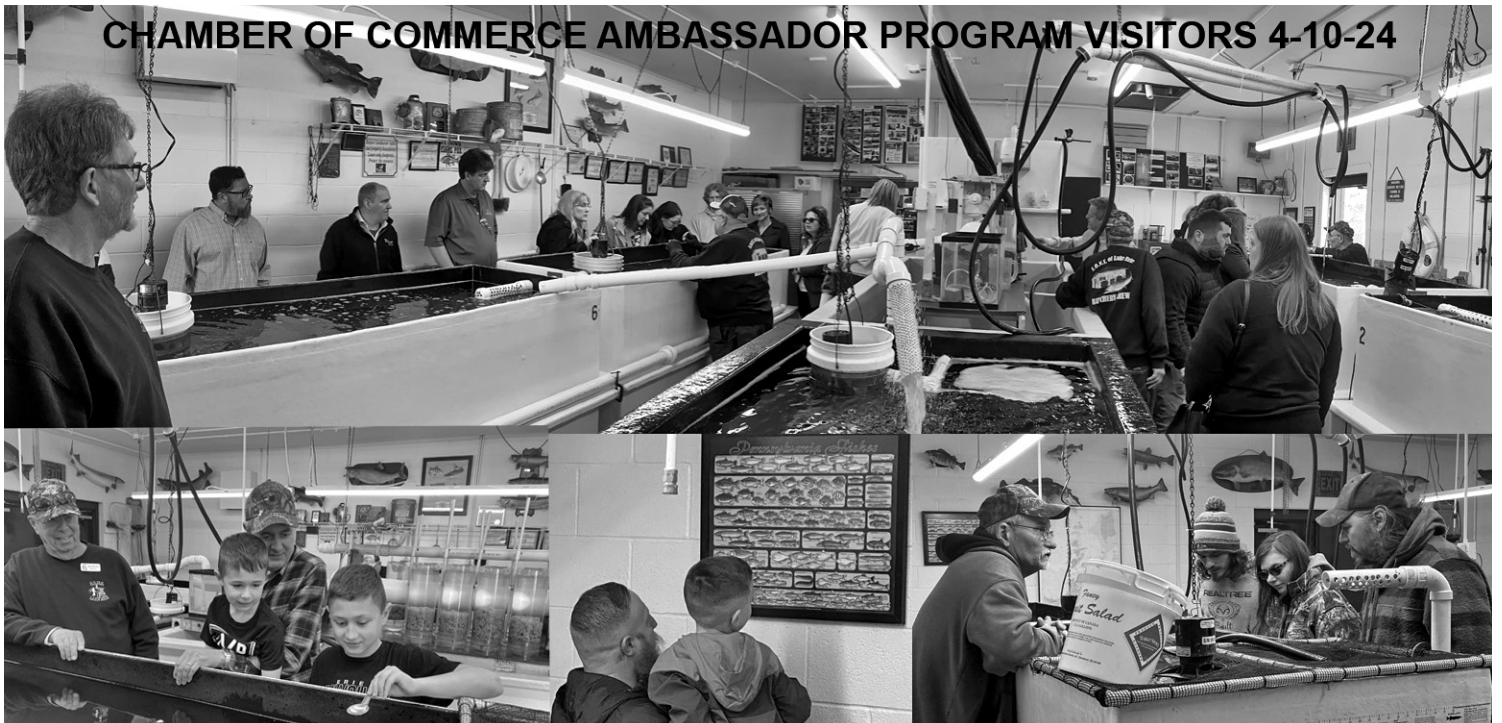
Above are pictures taken at our hatchery open house on April 13&14 as well as April 10.

Last month's issue of the "Bucket" highlighted the stocking of brown trout and the arrival of 1.6 million walleye eggs. The walleye eggs completed their hatching cycle on April 12 affording the opportunity to show off our great facility and brag about the hard work of our volunteer hatchery crew. The public was invited to tour our facility on Saturday and Sunday April 13&14. A few days earlier on April 10, twenty seven participants from the Erie Chamber of Commerce Ambassadors program toured our hatchery.