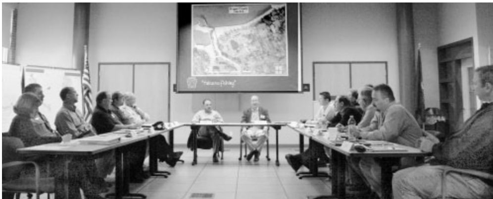
The Lake Erie Advisory Committee at their first meeting on Nov. 1, 2011