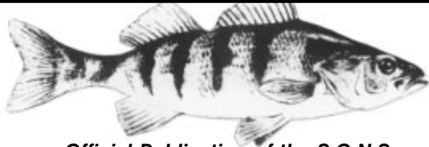
Official Publication of the S.O.N.S.