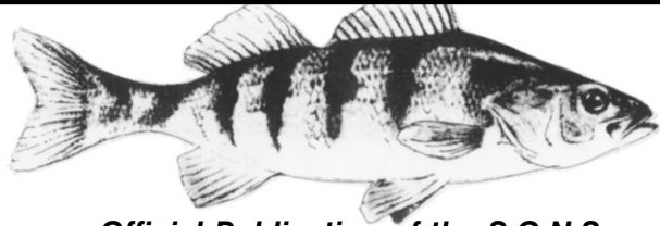
Official Publication of the S.O.N.S.