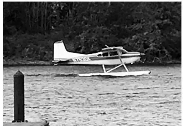
This photo was submitted by John Skrzypczak on Sunday Sept. 8, 2024. Taken that day.

have been landing in the bay and refueling in the PI Marina. PI Bay was designated as a seaplane area in 2023 with the approval of the USCG, DCNR, DEP and more agencies.