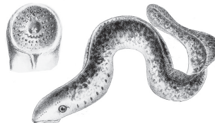
Lampreys attacking brown trout