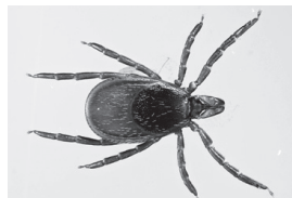
Ixodes scapularis, dorsal female aka deer tick

Another bug to watch out for is the spotted lantern fly which although not dangerous to humans but threaten our environment by damaging our crops especially vineyards. Two were recently spotted in Erie County and we have been asked to be on the lookout and kill them on sight.