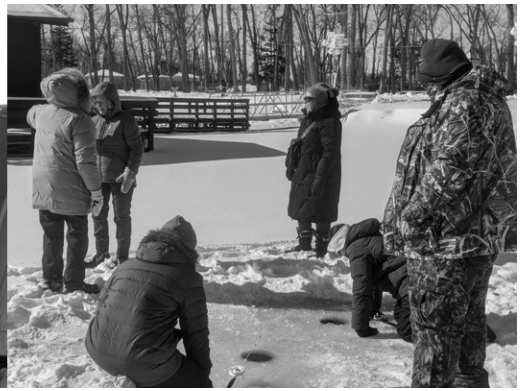
LtoR Fishing outside while inside the hut a nice brown trout is caught while others try outside