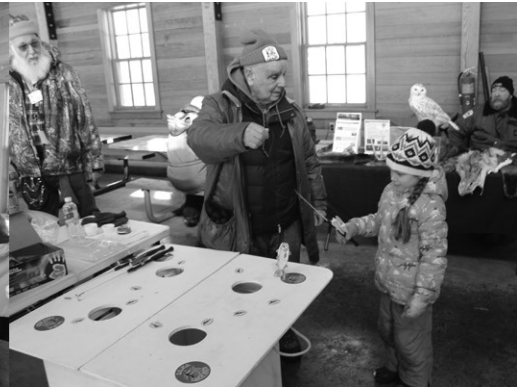
LtoR Winter Discovery Day participants come to warm up and get a hot lunch while kids gather around to play the SONS ice fishing game.