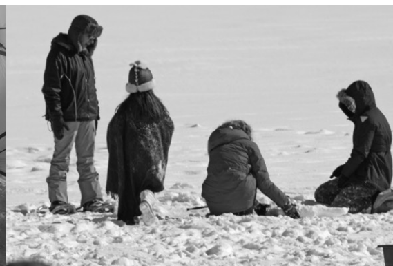
LtoR Volunteers gather outside warming tent, inside tent Environmental Specialist helps kids fish while others try it outside.