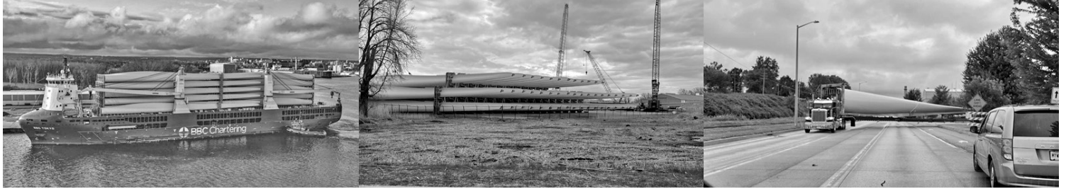
Ship load of 275 long turbine blades were unloaded and set aside for moving to their final destination as show in photo of truck hauling one on the Barkway.

We cannot let that happen. A wind farm construction could cause irreparable harm to Lake Erie, its fishery and our water supply. There are hundreds of years of contaminants sealed under the floor of the lake and I fear building these 500 foot towers will disturb these layers causing an environmental disaster.