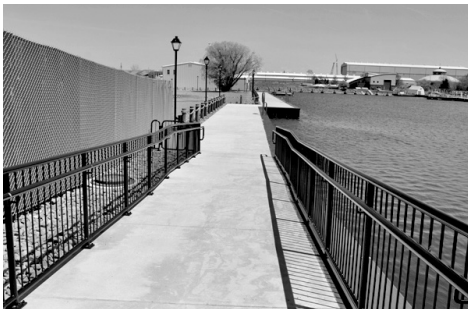
New fishing opportunity

The sea wall on the South face of the East arm of the Public Dock (East Dobbins Landing) has been replaced. A 12 ft wide public accessible sidewalk has been installed as well as new lighting. This opens up about 300 ft of new fishing areas in the waters of the East Canal Basin. Enjoy it and keep it clean!