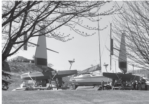
Two saildrones being prepared for deployment