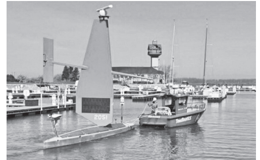
Boat from Lake Shore Towing Co. moving one of the vessels onto the bay.

Motorists traveling along the western end of the Bayfront Parkway in late April observed two strange looking vessels being assembled in the parking lot of the yacht dealer which is located there. These vessels are built by a company called Saildrone. According to their website this model is called "The Surveyor". It is a 20-meter unmanned surface vehicle that can be used for underwater mapping, water currents and even possibly military applications. Designed for months at sea, Surveyor uses radar, EO/IR, ML-based detection, passive acoustics, AIS, and high-power oceanographic payloads to operate independently across the world's harshest environments. These two drones were deployed onto Lake Erie for the United States Coast Guard and will be out there on the lake for some time.